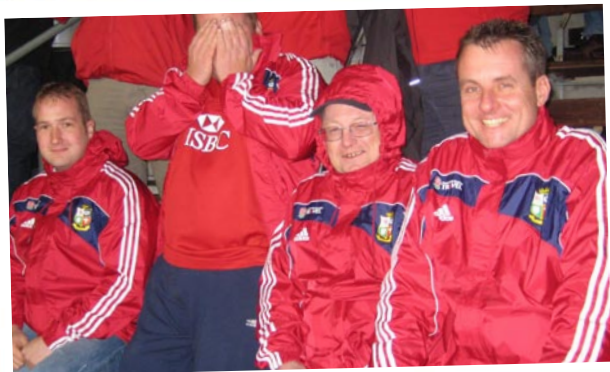
England Rugby Travel Waterproof Jackets Came In Handy!