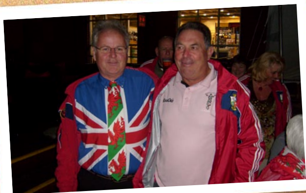
Caracal Tourists Wearing The British & Irish Colours With Pride