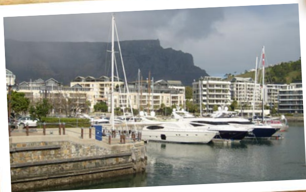
Time Spent At The Waterfront In The Shadow Of Table Mountain

England Rugby Travel customers travelled to Cape Town for the clash between the Emerging Springboks and the British & Irish Lions. The wet weather did not dampen the spirits as the supporters packed into Newlands to cheer on the boys, and enjoyed the sights of Cape Town.