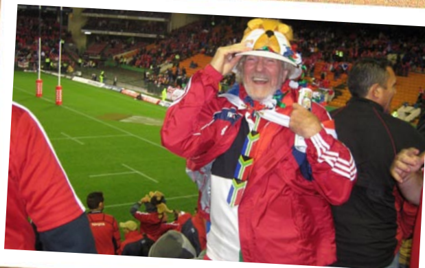
Braving The Elements At Newlands For The Match