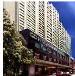
WHARNEY GUANG DONG