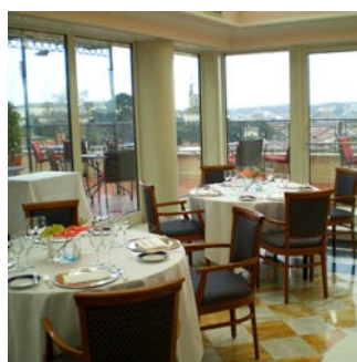
HOTEL BERNINI BRISTOL